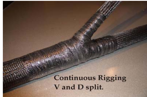
Continuous Rigging V and D split.

SmartRigging has developed the continuous rigging system in cooperation with a number of large ocean racing teams. This new system eliminates interruptions in the stays at the level of the spreaders. The different Diagonal and Vertical cables are fully integrated into a single cable that runs from the V1 turnbuckle upwards via the spreader to the mast. This eliminates the need for pins, strips or tip cups at the extremities of the spreader end, while retaining extremely strong links. In addition to improving the appearance of the spreader ends, they are 15% lighter than the traditional pin system.